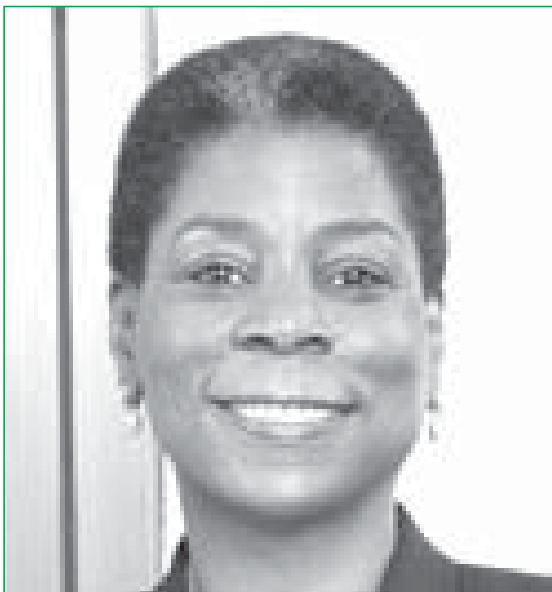
Ursula Burns, CEO of Xerox

When Burns joined Xerox in 1980 as a mechanical engineering summer intern, the company was the leader in the global photocopying market. As she later assumed roles in product development and planning, the company was securing its leadership position in digital document technologies. From 1992 through 2000, Burns, at a pivotal point in the company's history, led several business teams including the company's color business and office network printing business.